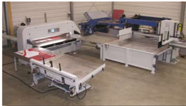
E-Line 260 in a cutting system: The profit center with two large transfer tables, jogger and restacker.